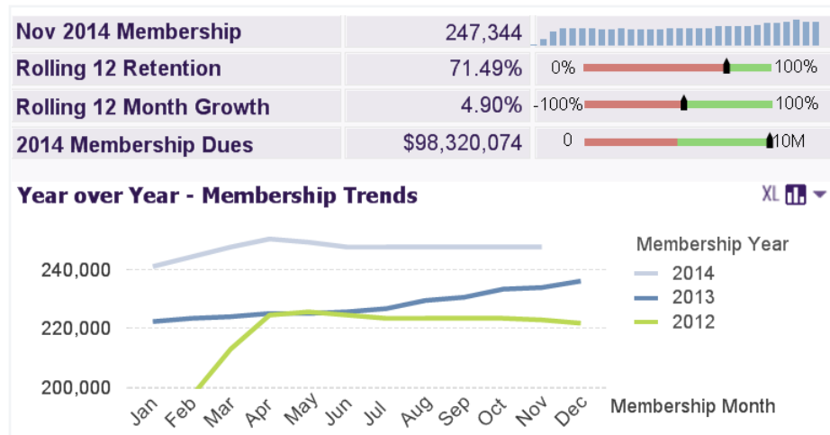
The membership executive dashboard shows an overview of membership, growth, and retention.